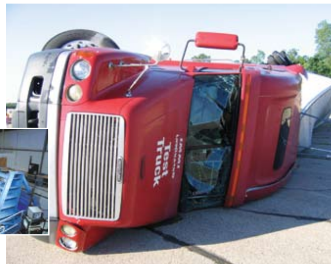
Tractor trailer roll test