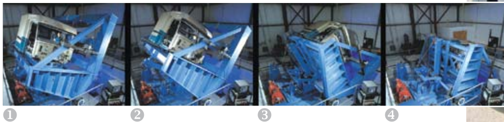
Roll center motion sequence

IMMI design engineers have access to CAPE rollover testing as well, conducting tests for commercial vehicle customers as well as guiding the development of new rollover protection systems for heavy trucks, buses and off-road vehicles.